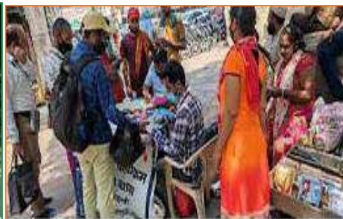
Health Camps for residents of Wazirpur by Target Intervention team, UVCT under DSACS program