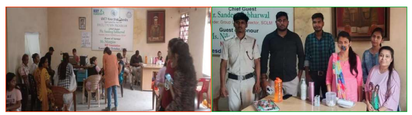
Multipurpose Camp to Update Aadhar Card/Voter ID and Covid Vaccination

Legal literacy Programme : The legal advisor and students from DSLSA (Delhi State Legal Services Authority) addressed the people on the spot and also provided them free counseling on legal matters