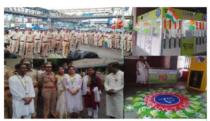
UVCT's Kalyan Railway Childline Kalyan, Maharashtra