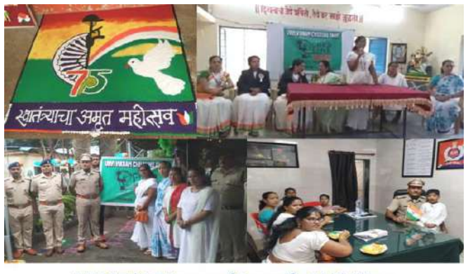
UVCT'S Thane (Rural) Childline Thane, Maharashtra