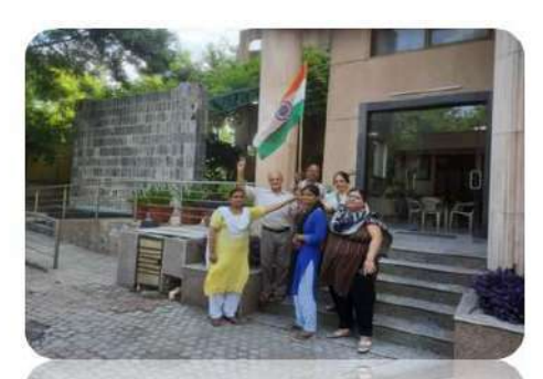
National Headquarters UVCT Urivi Vikram